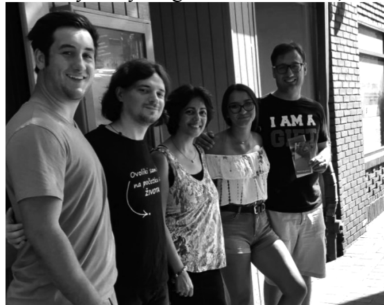
DOWNTOWN TO PP WITH LISA

Al is 90 years young on November 24, 2019