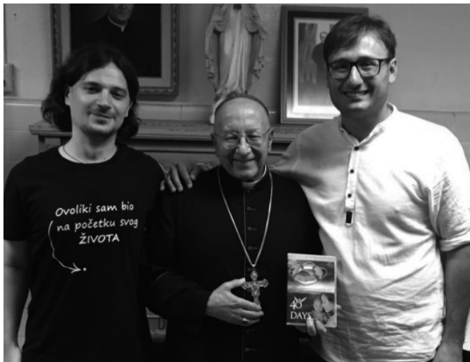
WITH BISHOP WILLIAM WALTERSHEID

KRUNO AND ANTE VISIT OUR CITY WITH FILM OF 40 DAYS FOR LIFE IN CROATIA. YOU CAN WATCH IT ON www..youtube.com/watch?v=AAzmOfToqsg&t=115s