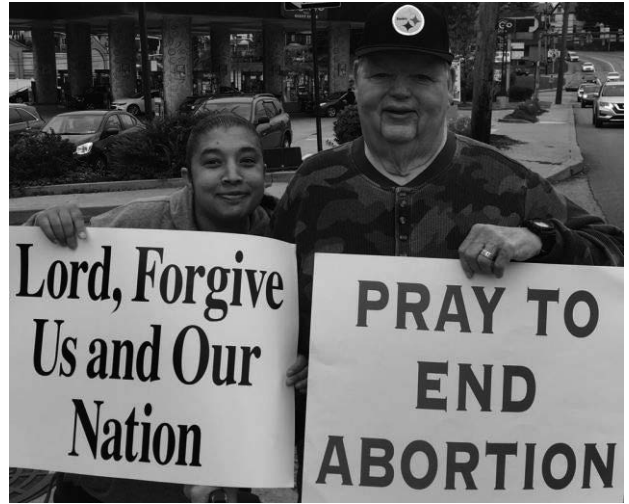
Friends from Liberty Boro & McKeesport

On Sunday, October 6, Life Chains wound from town to town, from highways to playgrounds.