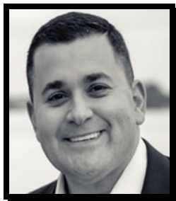
Meet: Nick Adams Pro-Life Author, Columnist, Commentator

Whole Page 6 ½ X 9 ½ – $150.00 Half Page 6 ½ X 4 ¾ – $100.00