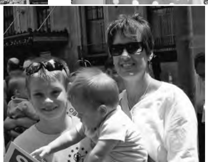
Stand Up For Life Rally – June 30 – Mellon Square Park, Downtown