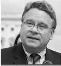
Rep. Chris Smith

America's historic mid-term elections sent the message that more Americans want their lawmakers to consistently defend vulnerable human life, said Congressman Chris Smith (NJ) the chambers most prominent pro-life leader.